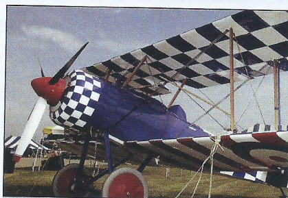
52 AirVenture 2005 draws 700,000 visitors and 10,000 aircraft.