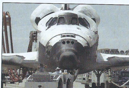
26 Engineers begin exam of Discovery thermal protection system.

44 Former L-3 exec talks about challenges with new company.